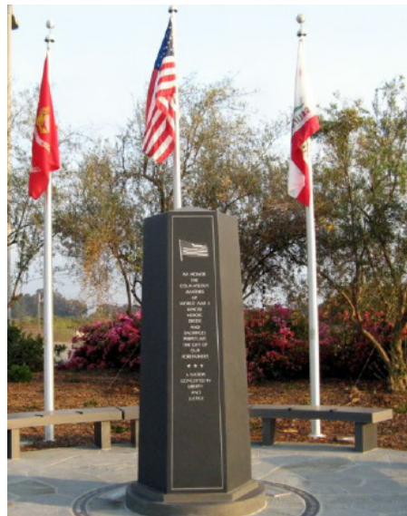
A black granite obelisk now stands near the eastern edge of the Santa Barbara Municipal Airport, an austere memorial to the local aviators who lost their lives and the Marine squadrons that trained at the airport during World War II.