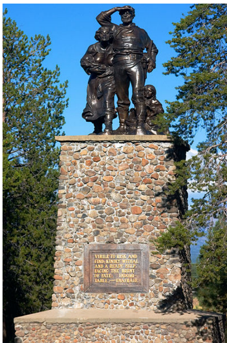
Donner Party Memorial statue: erected in June 1918. Statue at Donner Memorial State Park; the top of the 22-foot (6.7 m) pedestal indicates how deep the snow was during the winter of 1846-1847.